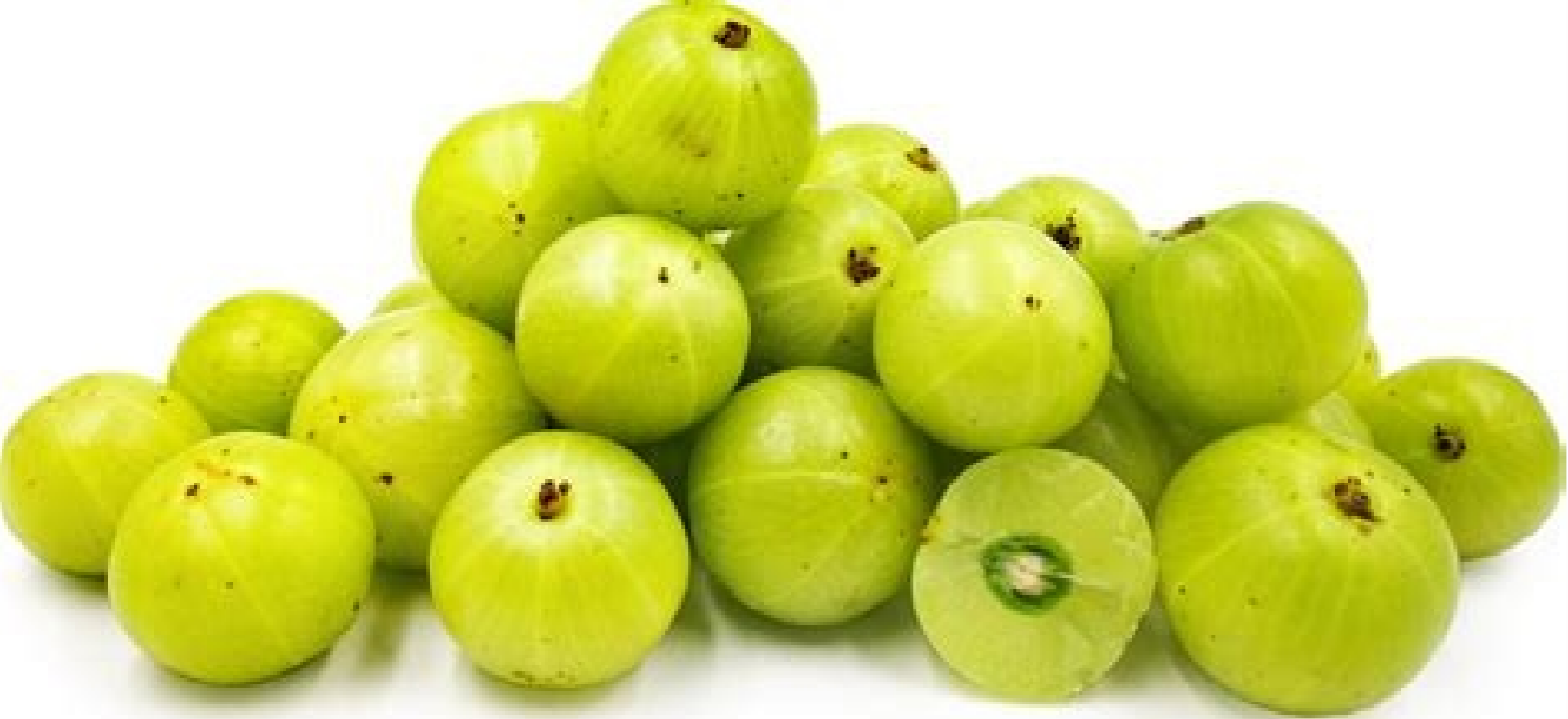
Amla medicinal plant information. Types of amla plant. Medicinal uses of amla plant. Benefits of amla plant. Amla tree information in english.