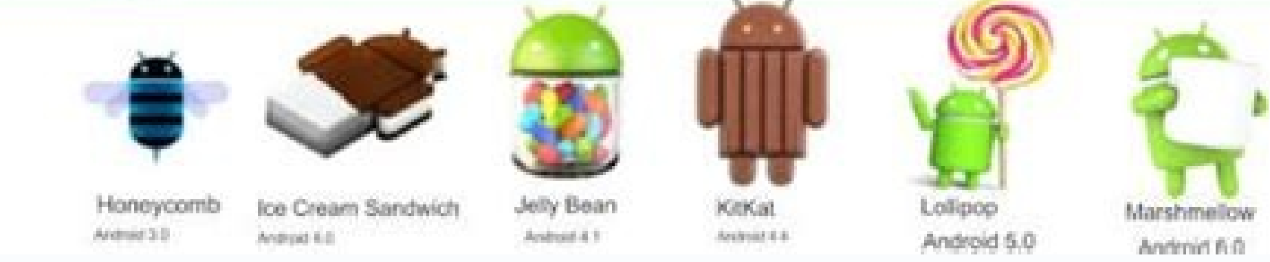
Android versions names and images.